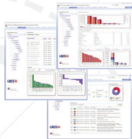
Enhanced visibility through LINC'S® Performance Reporting and Analysis module

For more information about USGGC's approach to identifying and closing the gaps and bridging disconnects in your management operating system, call us at (800) 888-8872 or visit our website at www.usccg.com .