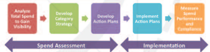
High-level strategic sourcing process flow